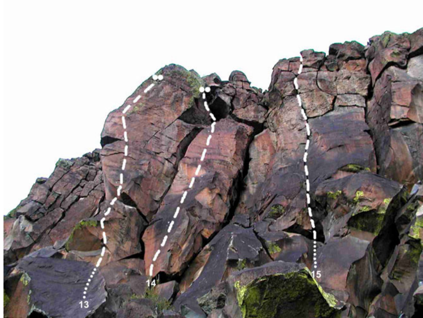
Figure 4: Gallow's Edge Upper Ledge