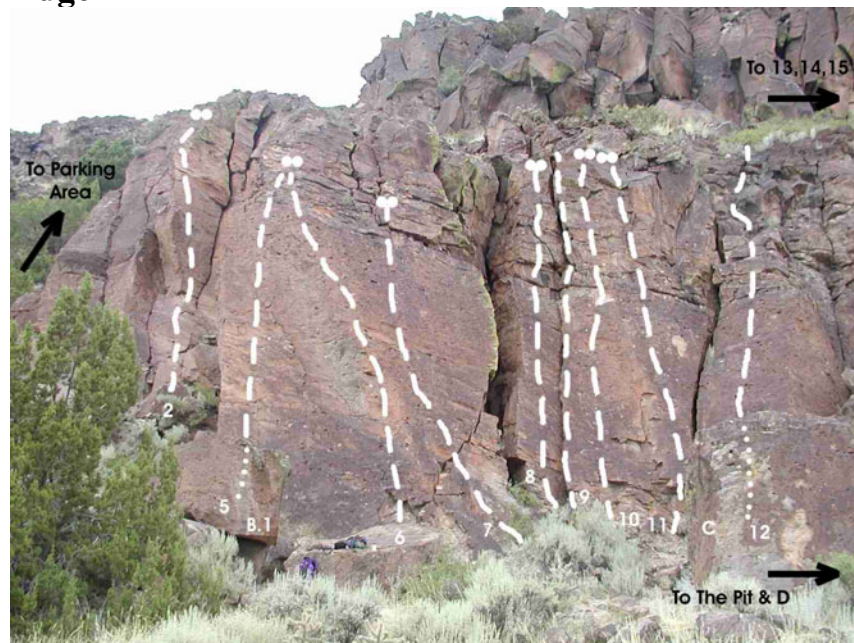
Figure 3: Gallow's Edge