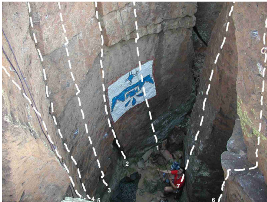
Figure 4: The Pit