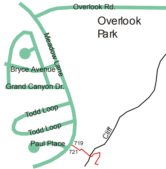
Figure 1: Directions to The Pit.

To get to "The Pit," park near 719 Meadow Lane in White Rock, being careful not to block mailboxes or driveways (several residents have complained in the recent past). Take the public access trail between 719 and 721 Meadow Lane. Go to Gallow's Edge, then head North for about 100 m. Watch out for anchors on the left side on top of some rocks, closed in by some big boulders. Pass anchors for 10 m, climb into a hole in the big boulders and work your way to the left, being careful of the loose rocks. Note you will have to climb down a few feet and then work your way up through a narrow opening to enter The Pit. Total approach time should be no more than 15 minutes. It's worth every single second!