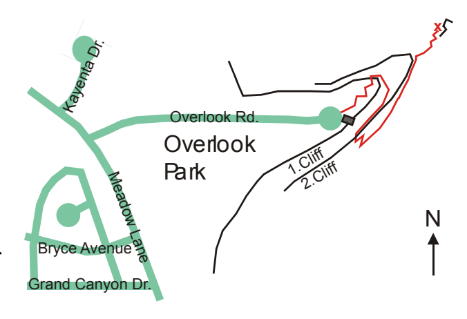
Figure 1: Directions to The Underlook.

Drive to the scenic Overlook in White Rock. Park at the dead end and hike to the end of the pointed cliff. The easiest way down is to the left, then hike around the pointed end and follow the obvious trail down the second cliff, that leads to the Overlook climbing area. Go to the pointed end of the second cliff, then head northeast and downhill on a smaller trail. After a couple of minutes you should approach the small northwest-facing Underlook. Total approach time about 15 min.